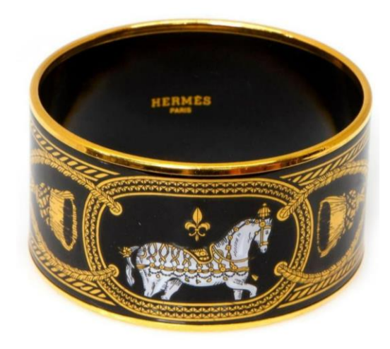
Lot 44: Hermès Enamel Bangle Bracelet, diameter: 2 1/2in., width: 1 3/8in.; signed Hermes Paris, Made in Austria+L. Estimate $300 - $500. (Photo, lower left)

Lot 12: Tiffany & Co. Turquoise & 18k Necklace/Earring Set, 18k gold; both signed T&Co.; fringe necklace measures 16in, earring length: 3/4in.; gross weight approximately 14.8 grams. Estimate $500 - $800. (Photo, bottom right)