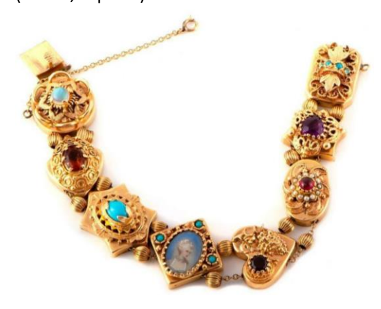
Lot 67: Stone-set and 14k Gold Slide Bracelet, gross weight approximately: 41.7 grams; length: 6 1/2in. Estimate $800 - $1,000. (Photo, top left)

Lot 203: Native American Beaded Vest, early 20th century with hide embellished by beadwork. Overall good condition with normal signs of wear