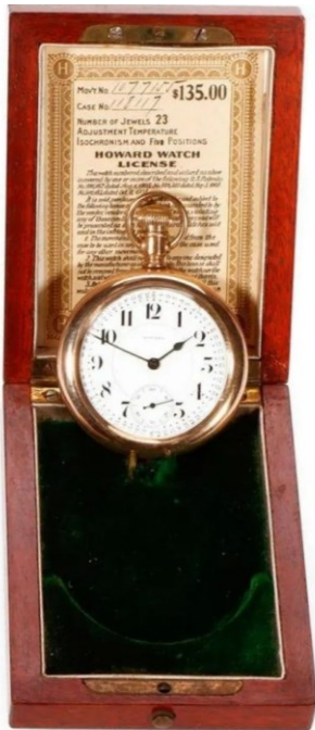
Lot 297: E. Howard GF Keystone Railroad Grade Pocketwatch. Circa 1912, open face, series 0, extra case, Masonic Free Masons logo stamped on case back, movement #1155350, 23j, special adjustment 5 positions including temperature, J Boss, Boston; 50mm dia. (very good condition). Estimate $300-$500. (Photo, lower left)

Lot 35: Collection of Simplex Automobile Ephemera. The grouping is in a binder and includes approximately 25 pieces of original ephemera (such as letters, receipts, advertisements/illustrations); a Simplex pin and triangular metal plate (glued to paper); original photos of cars/engines mostly c. 1960s-1980s, a few older (total approx. 55); a 38-page facsimile book, and contemporary clippings. Together with a photocopy of The Simplex Automobile Company book/catalog, and other related copied articles (housed in a binder). Estimate $100-$200. (Photo, bottom right)