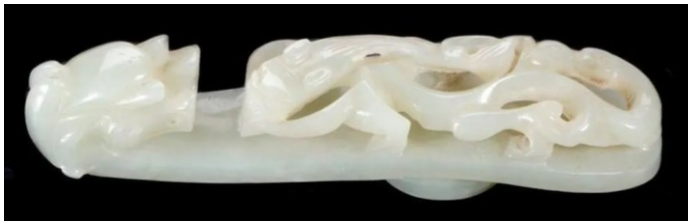
Lot 224: 19 th -Century Chinese Jade Belt Buckle.