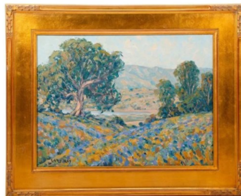
Lot 67: Artist: Gary Ray (1952 - ). Title: Lupine, Oaks & Eucalyptus. Size: 12" x 16". Year Created: not given. Signature: Signed Medium/ Ground: Oil / Board. Estimate $800-$1,200. (Photo, top right)